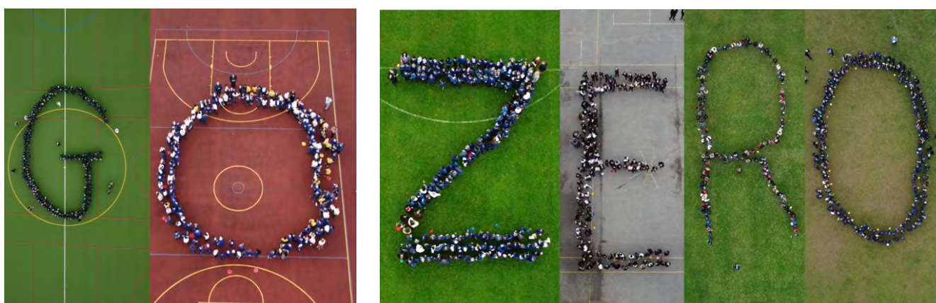
Drone footage of the schools spelling out GO ZERO during environmental sustainability week