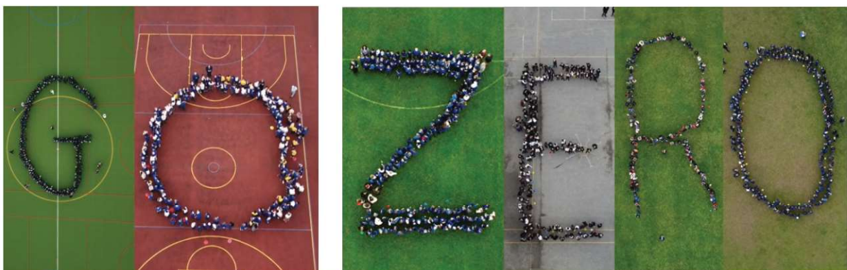
Drone footage of the schools spelling out GO ZERO

Hema, Year 11 sustainability prefect, Vyners