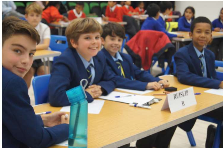
One of Ruislip High's teams in the maths challenge

This year's event took place on Wednesday 9th October 2024. As each team took part in the challenges, they demonstrated remarkable commitment, pushing themselves to tackle the problems and collaborate effectively with their teammates.