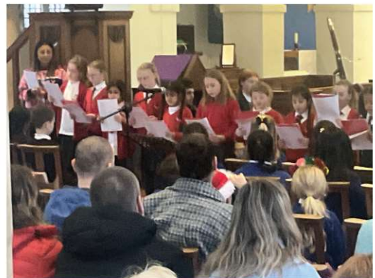
Students performing at the carol concert

This year's concert took place on Wednesday 11th December 2024 at St. Lawrence's Church in Pinner. It was the first time the event was held at this church, which had standing room only by the time the concert started. The concert included student performances and readings - one from each school - as well as everyone singing collectively uplifting Christmas carols.