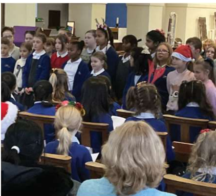
Students performing at the Christmas concert

All these activities were made possible by the staff who organised and hosted them; they are thanked for their commitment to our students' education, in particular broadening their horizons beyond the classroom.