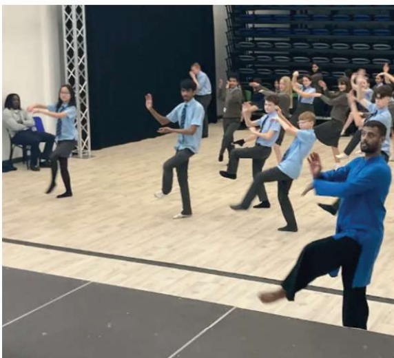
Students at Ruislip High learning a dance

Another key goal of equality week was to promote discourse about the language used to describe individual differences. The words people use shape perceptions and the week focused on how respectful, inclusive language fosters an atmosphere of belonging. The week encouraged students to engage in discussions about how language influences stereotypes, biases and their understanding of identity.