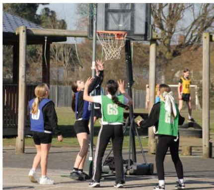
Students participating in the netball tournament