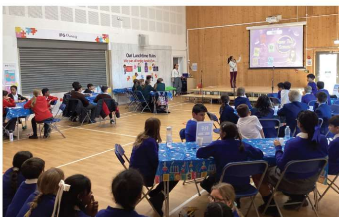
Students participating in the science challenge