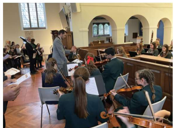
Students performing at the carol concert