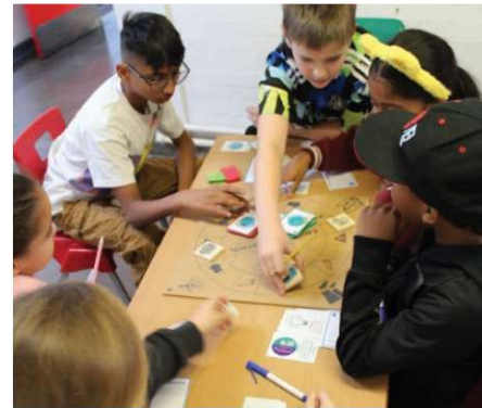
Field End eco warriors playing the Emission Control game

The second environmental sustainability week took place from Monday 11th to Friday 15th November 2024. There was an opening ceremony video produced which involved taking drone footage of students from each school forming one letter to create the words GO ZERO. There were a variety of activities throughout the week, both Trust-wide and school-based.