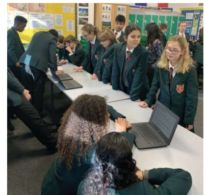
Students at Vyners enjoying a languages breakfast