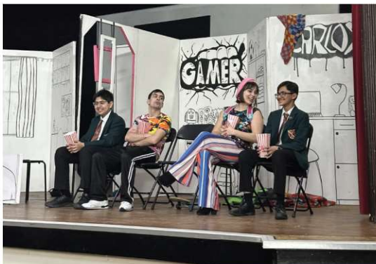
Volunteers at Vyners playing extras in the Spanish play by Onatti Productions

Throughout the week, language-themed activities were delivered in lessons across the schools to demonstrate to students the influence of languages across the curriculum. The week was such a great success that it is going to be expanded in 2025-2026 to include all the schools in the Trust.