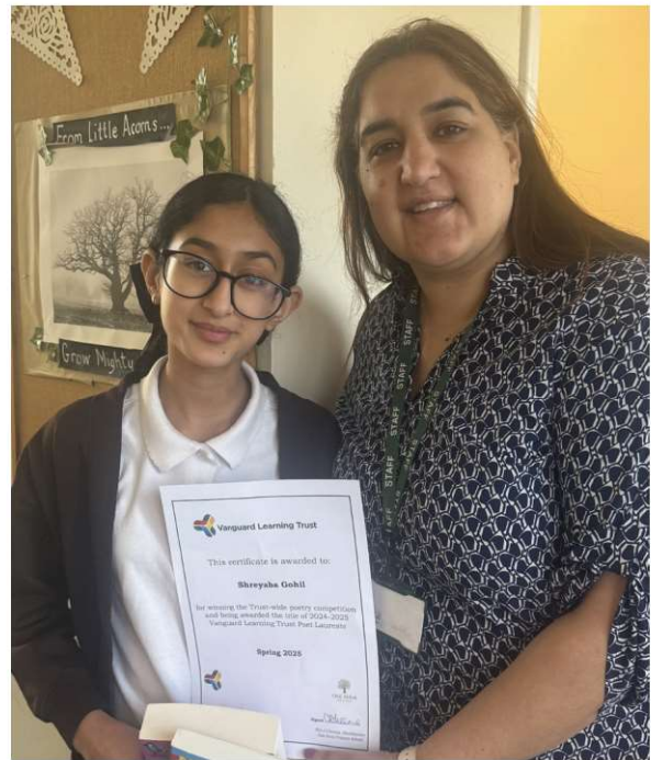
VLT Poet Laureate for 2025

'If all the world were paper' by Joseph Coelho