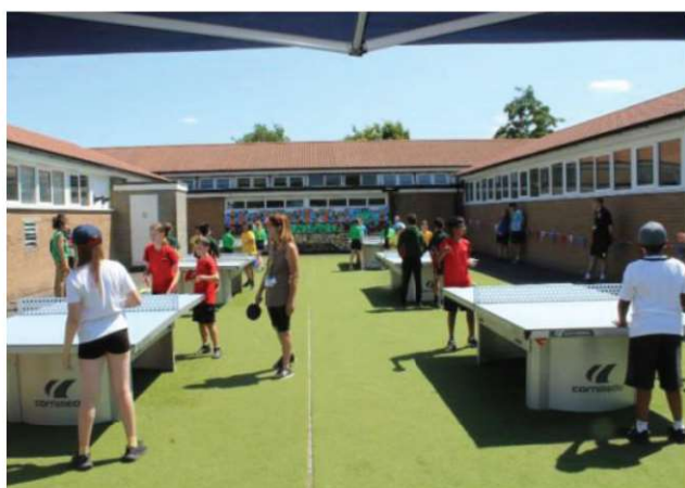
Teams in action at the table tennis tournament