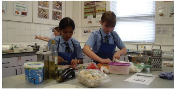
Students from Ruislip High preparing their dishes

The cooking competition has taken place for the last two years and is organised and hosted by Vyners. Schools are invited to select two students from either Year 5, 6 or 7 to cook a meal in timed conditions and judges then grade the meals based on presentation and taste.