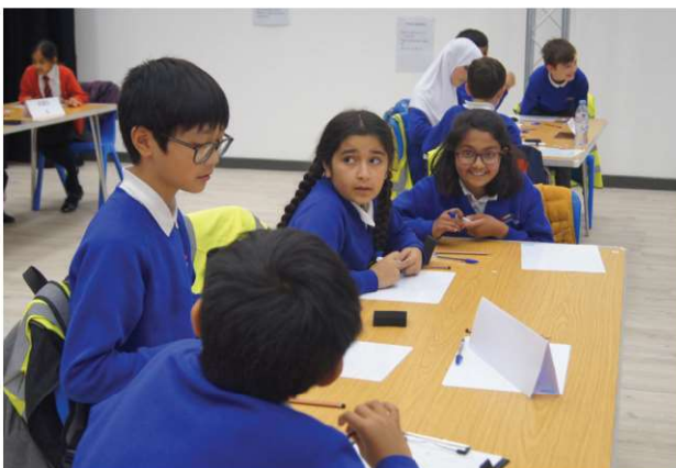
One of Hermitage's teams in the maths challenge

The Trust maths challenge continues to be a celebration of collaboration, perseverance, and the joy of learning. It is a testament to the vibrant community that makes the Trust so special.