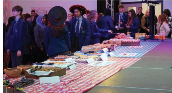
Ruislip High's students at the languages breakfast

The secondary school languages week is a new event that took place for the first time this year. It involved Ruislip High and Vyners taking part in various activities such as watching films and plays in French and Spanish, hosting languages breakfasts, and inspirational talks on how learning languages can help students in the future.