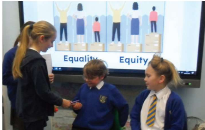
Year 5 students at Ryefield taking part in an art competition