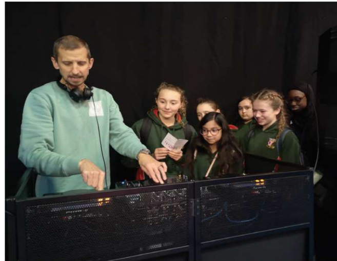
Students from Vyners at Thorpe Park

The event took place on Tuesday 15th October 2024 with circa 500 of the Trust's students in attendance. The day was filled with engaging workshops from industry experts for students to engage in, including pre- and post-learning activities. The park was 'gamified' with students' learning and engagement earning them access to the rollercoasters. The day was a resounding success and enjoyed by all participants.