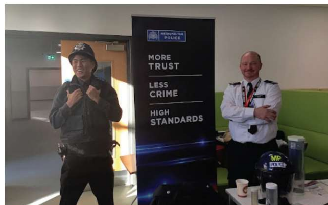
Stall holders at the careers and higher education fair