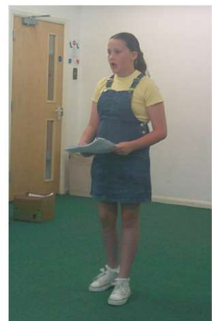
Participants in the oracy celebration