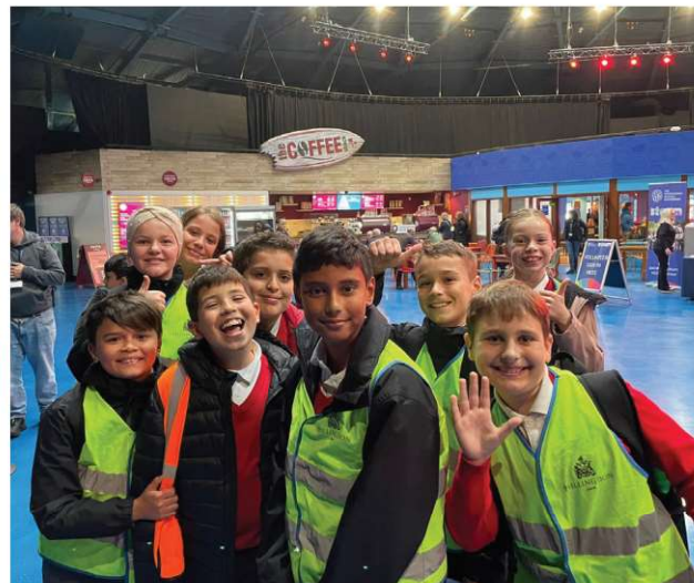
Students from Ruislip High and Field End enjoying the activities at Thorpe Park