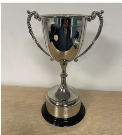
The VLT cup