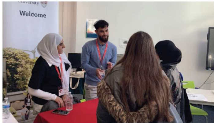
Students at the careers and higher education fair

The sixth form careers and higher education fair took place for the first time this academic year. It was an opportunity for sixth form students from Ruislip High and Vyners to visit a range of careers and university stalls in order for them to find out more about the opportunities available to them and how to apply.