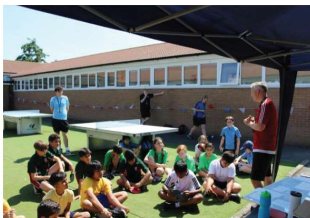
Participants at the table tennis tournament