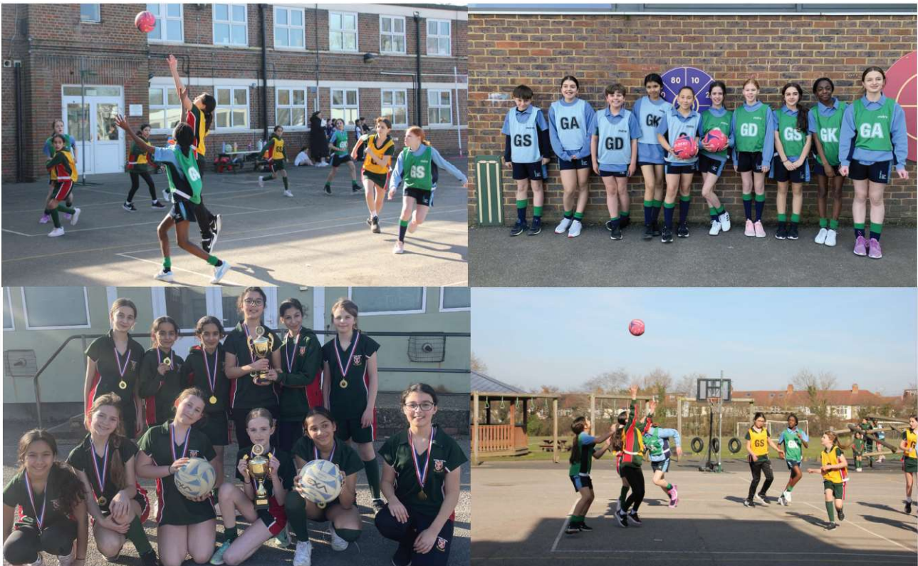
Teams participating in the netball tournament and the winners with their trophy