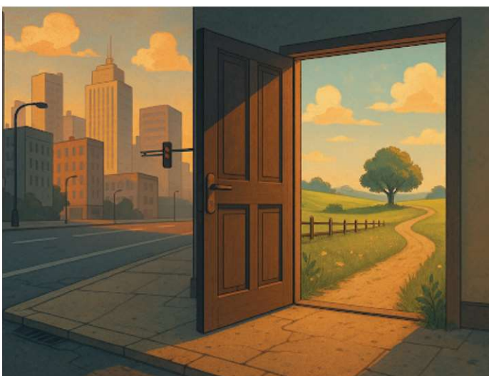
One of the most popular images chosen by Year 6 students

'It has been such a pleasure to develop this challenge with the Trust's literacy leads and local authority accredited writing moderators. They wanted to develop a writing day for Year 6 pupils, and the success of this type of creative writing for students is evident in the quality of the entries that we have received.'