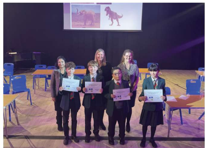
Vyners' winning spelling bee team